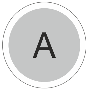
Metal Plate (Back of Phone)